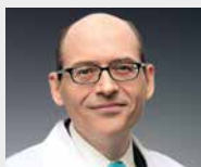
Michael Greger, MD