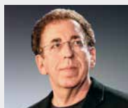
Dean Ornish, MD